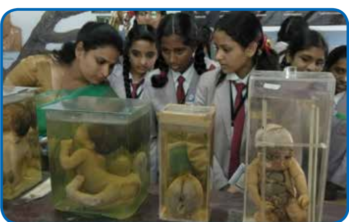
Visit to Mysore Medical College Museum on 7th September by the students of class X